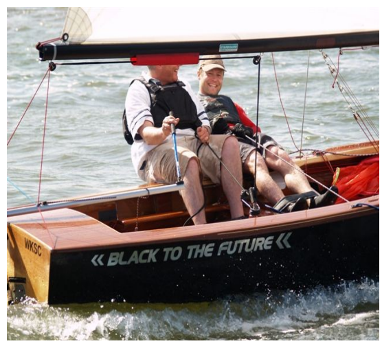
From this. .to this

When my daughter went to her first Cadet Nationals as a helm, she put in two separate requests for redress after racing on the first day! This bought me to notice the protest committee and vice versa, and I was co-opted onto the protest committee as a novice member for the rest of the week! After that, I got into team race umpiring back at West Kirby, including the Grade 1 Wilson Trophy event held there. Then, steadily I was invited as judge or umpire to more events in the UK and qualified both as an RYA National Judge and RYA National Umpire in the 1990s.