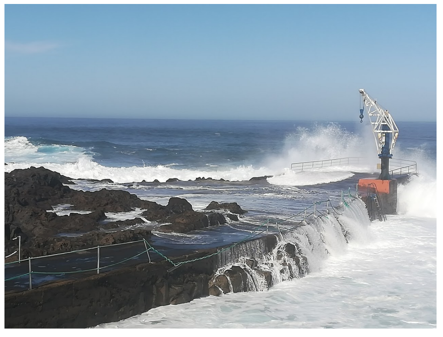
3 hours before low tide— El Pris, Tenerife, January 2020