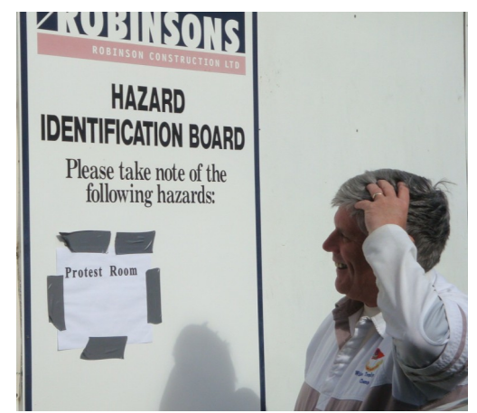
Protest Room in New Zealand

will also be a judge in a cabin scanning all the television coverage. This approach is going to be more helpful for protest hearings than fleet race umpiring – you can't have 2 minute 'VAR' delays on a on-the-water decision. I was recently at a World Championship and we gave an immediate decision on an incident at the windward mark – 1-2 minutes later, my fellow judge, who was behind me, said 'We made the right decision – I've just watched it on TV replay!' I think it is going to be a long, long time before 'VAR' comes to Yeadon SC.