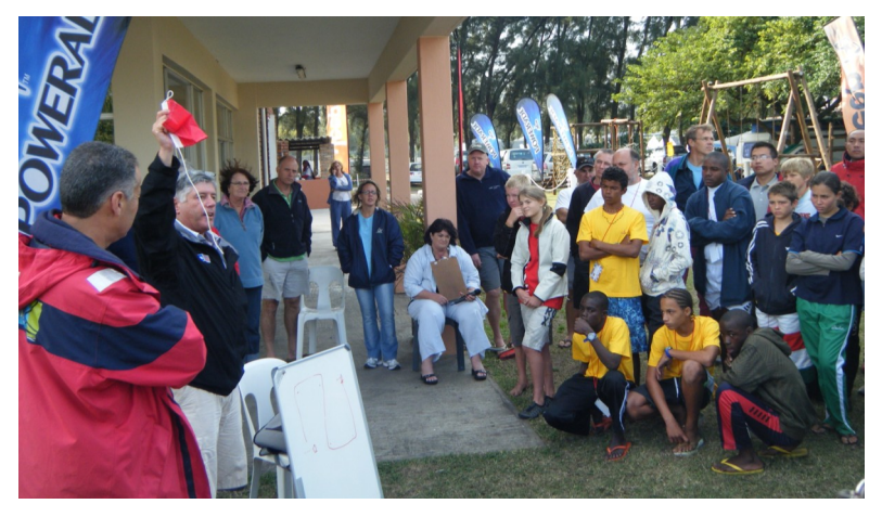
Teaching at the African Optimist Championships, South Africa