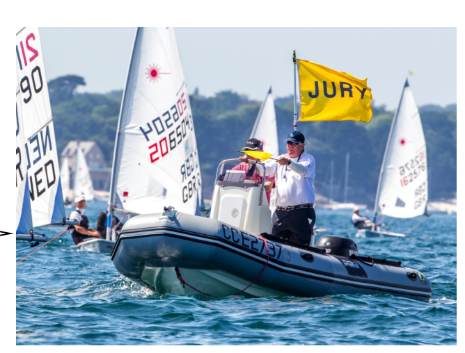
Rule 42 penalty European Laser Masters